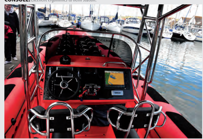
ONBOARD: Note the well gaurded windscreen via its hand-rail above. Lumber-support seats